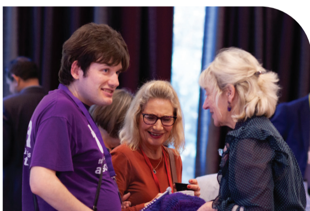
Support and information

Visit tuberous-sclerosis.org or call 0300 222 5737 to find out how you can help